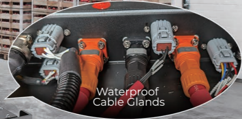
Waterproof Cable Glands